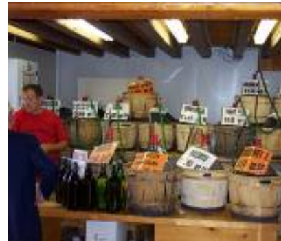
BYOB wine shop in Venice

It has been sometime since our last newsletter. The inspiration for this one came from our recent trip to Italy. We experienced some of the best food and wine that Italy has to offer; and it wasn't expensive or complicated. Some of our best meals were prepared by us in our rented apartments and villa. For example, in Venice we purchased fresh fish from the giant open air fish market and complimented it with wine from the local "jug" shop, where for a few Euros you could have them fill your used one Liter plastic water bottle with wine to take home. In Tuscany, we enjoyed the local pasta called pici, a fatter version of spaghetti, with a fresh homemade tomato sauce that included some pancetta, sliced thin for us by the local butcher. Once we arrived at Lake Como, risotto was in order; prepared with porcini mushrooms and pesto and enjoyed with a local white wine.